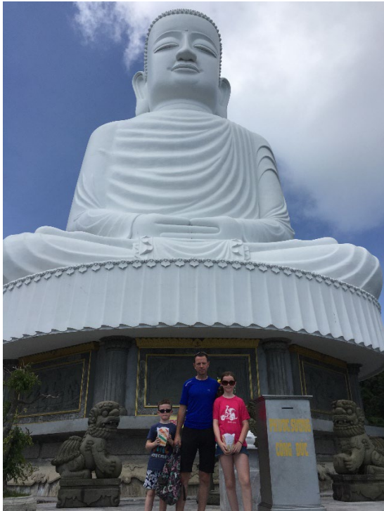
Ba Na Hills