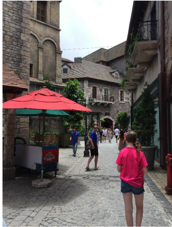
Ba Na Hills