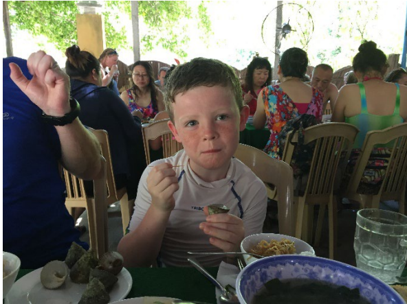
Snails for lunch