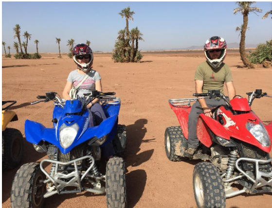
Quad biking in the desert