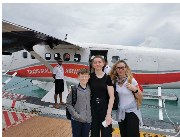
Sea plane to the resort