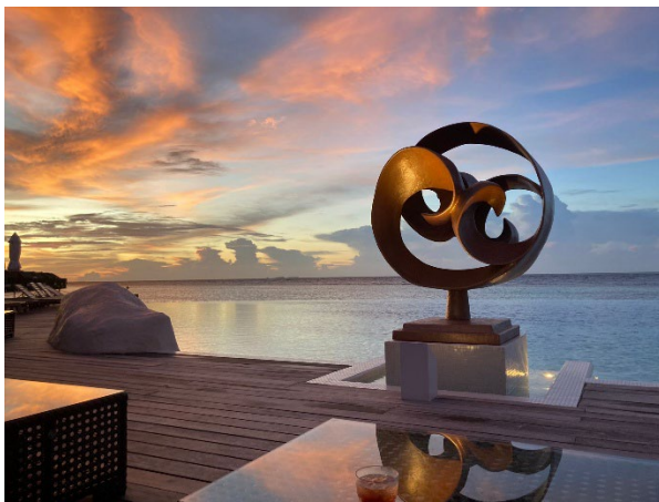
Sunset at the AQVA bar

The hotel arranges many excursions click here for a full list