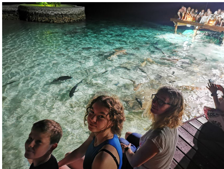
Local sea life, including manta ray and sharks being fed

Evening: watch the local sea life being fed