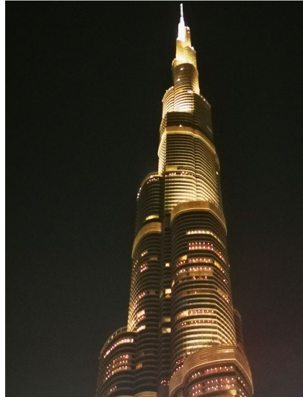
The Burj Khalifa