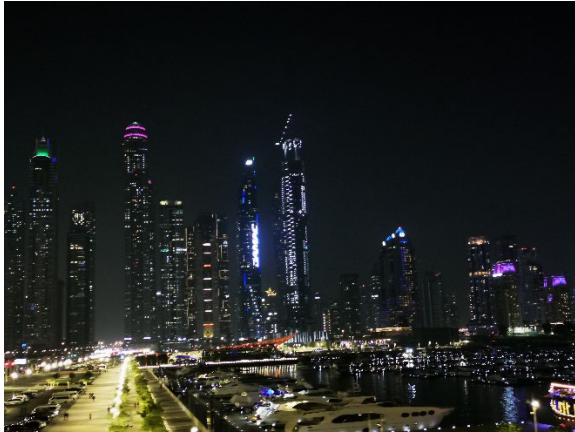
Dubai at night

https://www.bigbustours.com/en/dubai/dubai-night-tour-ticket