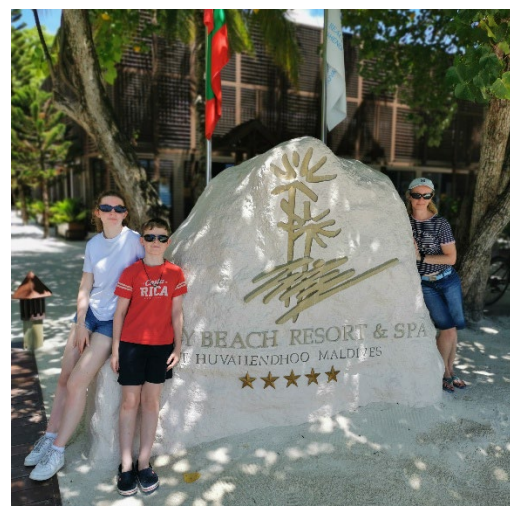
Lily Beach Resort