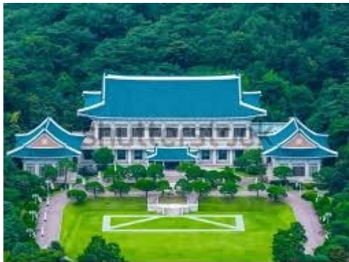
The Blue House