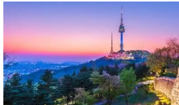
N Seoul Tower