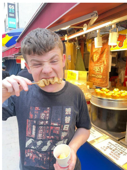
Fish flavoured pancake 'Eomuk guk'