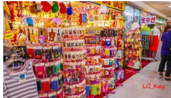
Myeongdong Shopping Street