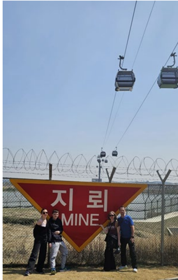
Cable car to the DMZ