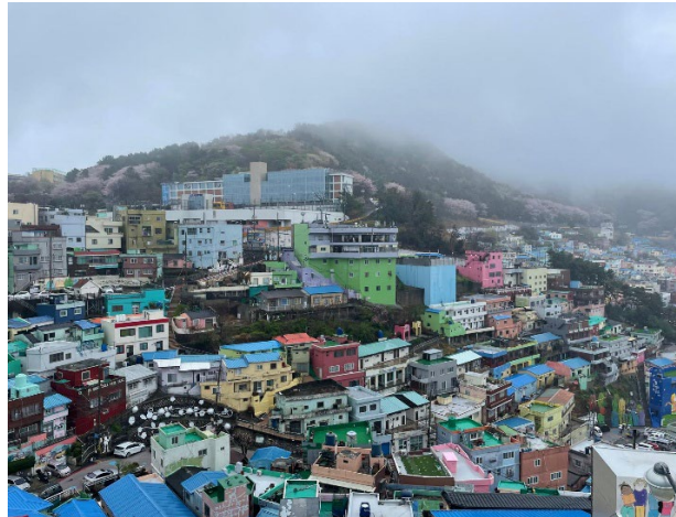
Gamcheon Cultural Village