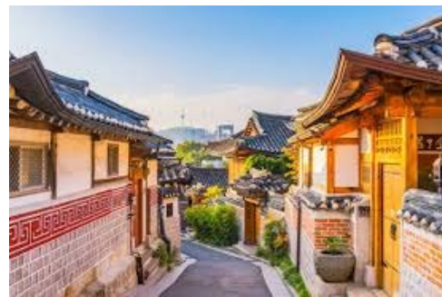
Bukchon Hanok Village