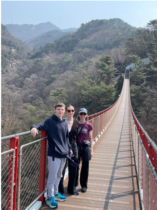
Gamaksan Chulleong Bridge