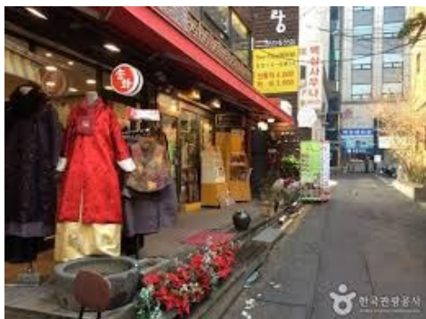
Insadong Antique Street